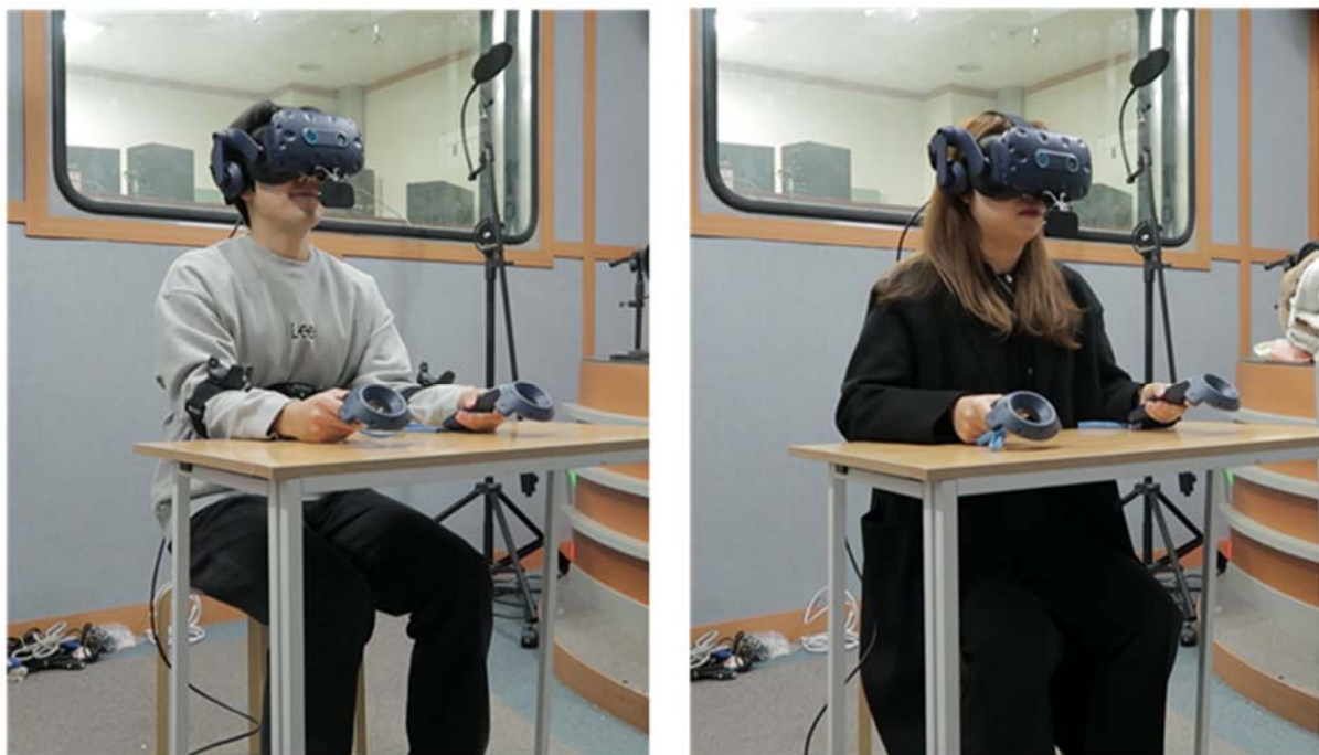
Figure 2. Two participants wearing the equipment for the experimental VR content.

At the beginning of Stage 2, we explained the VR equipment (Oculus VIVE Pro Eye HMD, two VIVE controllers, three VIVE motion trackers, and one VIVE Facial Tracker) to the participants. One motion tracker was worn below the chest, and one on each elbow, and the facial tracker was attached to the lower part of the HMD and worn together with the HMD. After the participant held the controller in both hands, as shown in Figure 2, the VR content was executed. The participant remained seated during the entire experiment.