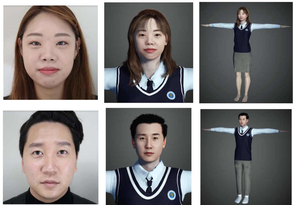
Figure 5. Examples of created female ( top ) and male ( bottom ) avatars: facial photographs ( left ); avatar faces based on the photographs ( middle ); full bodies of the avatars ( right ).