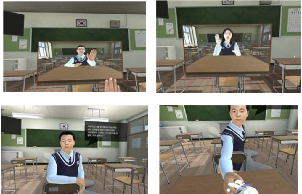
Figure 4. Sample views of the experiment stimulus from the user's perspective: virtual mirror with male and female avatars ( top ); interaction with a virtual character who tells a story to the user ( bottom ).

as school uniforms using Marvelous Design and applied to the characters. Two body types were used for females and males, respectively. In the case of the Group 1 avatars, the shape and color of the hair and facial hair were applied according to the participants' photographs. Examples of female and male avatars created based on photographs are presented in Figure 5.