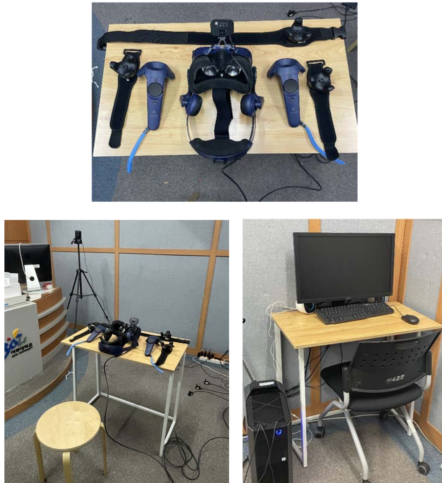
Figure 3. Experimental equipment and environment: VR equipment ( top ); experimental environment ( bottom left ); the computer used for the experiment ( bottom right ).

in the virtual environment; this was aimed to promote presence. The two scenes were modified according to the experiment's requirements. For example, additional instructions were added to the mirror scene for the participants to use their body, as this was aimed to enhance embodiment.